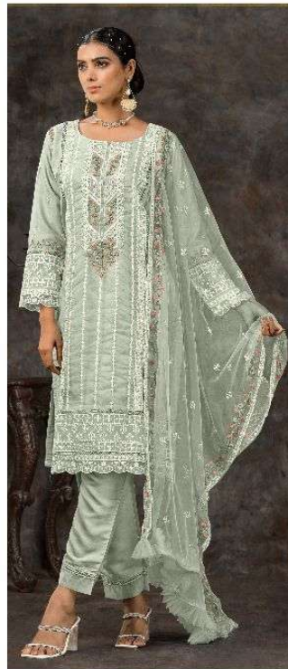
C - 1680 C