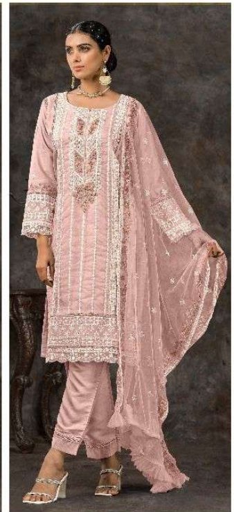
C - 1680 D