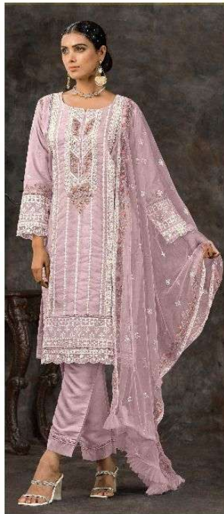
C - 1680 B