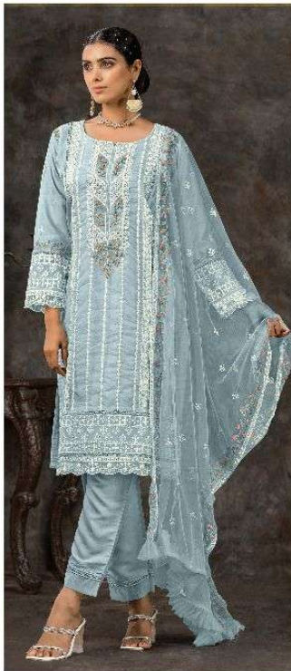
C - 1680