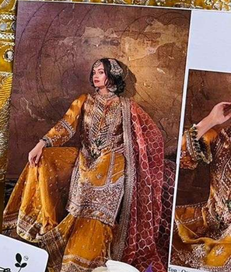
Top: Organza heavy emb Inner T/B: Heavy santoon Bottom: organza heavy Dupatta: Organza heavy et