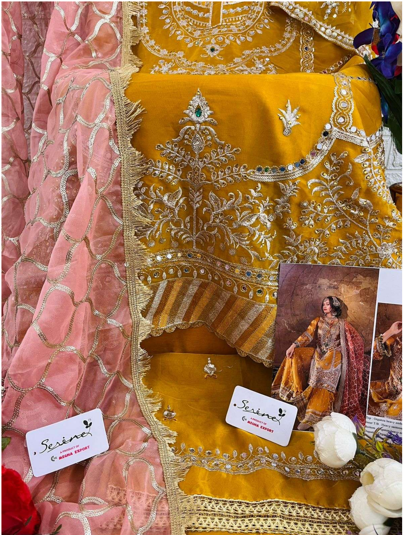
Top: Organza heavy emb Inner T/B: Heavy santoon Bottom: organza heavy e Dupatta: Organza heavy e