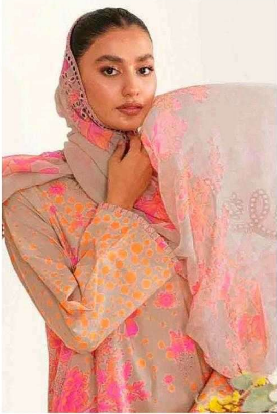
PUT YOUR IRON HAND IN A GLOVE