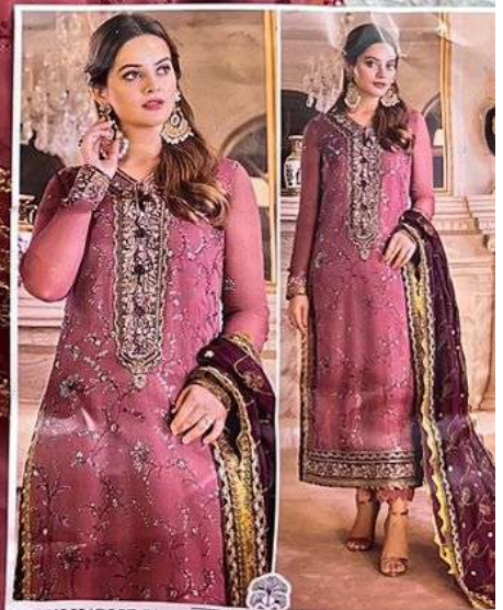
KHUSHBU Vol-4 ZAHA D.No. 10134 TOP Faux Georgette with Embroidery BOTTOM-INNER Chul sambhoos DUPATTA Neelima with Embroidery