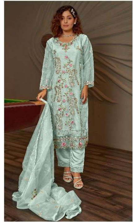
C - 1601 C