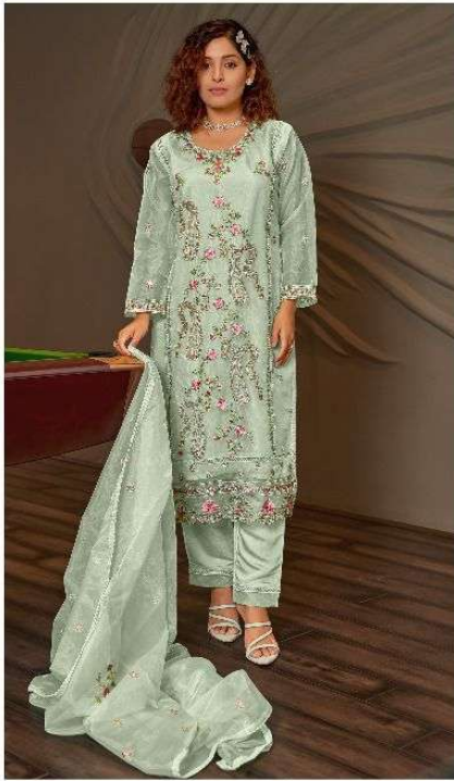
C - 1601