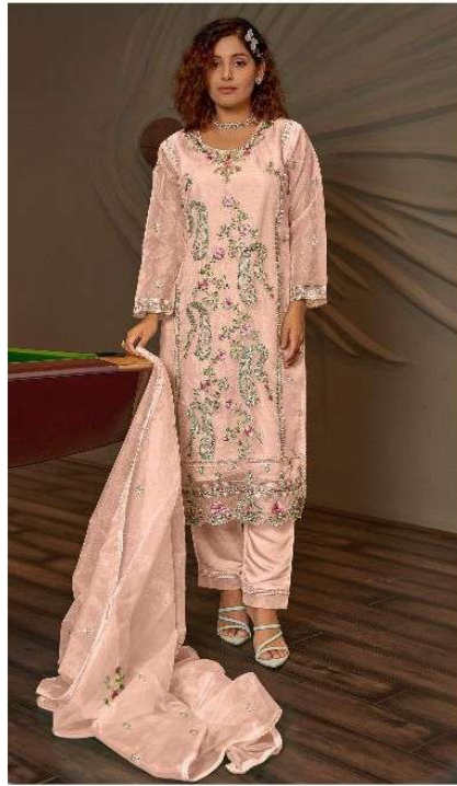
C - 1601 B