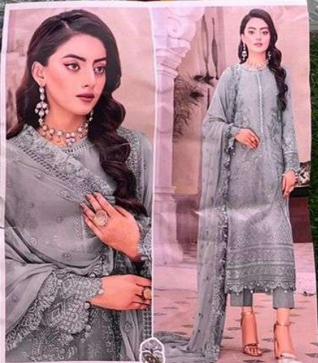
Z D.No.102 TOP Organza with Embroidery (Cut: 2.5 Mtr) BOT DUPATTA with (Cut: 2.5 Mtr)