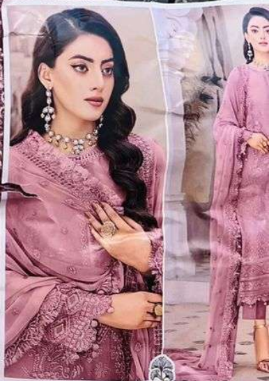
ZANA Q.No.1 TOP Orpiza with... BOTTOM-INNE DUPATTA