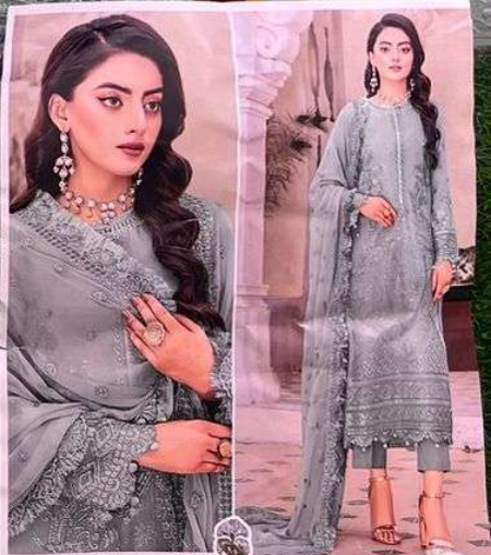
Z D.No.102 TOP Organza with Embroidery (Cut-2.5 Mtr) BOT DUPATTA with (Cut-2.5 Mtr)