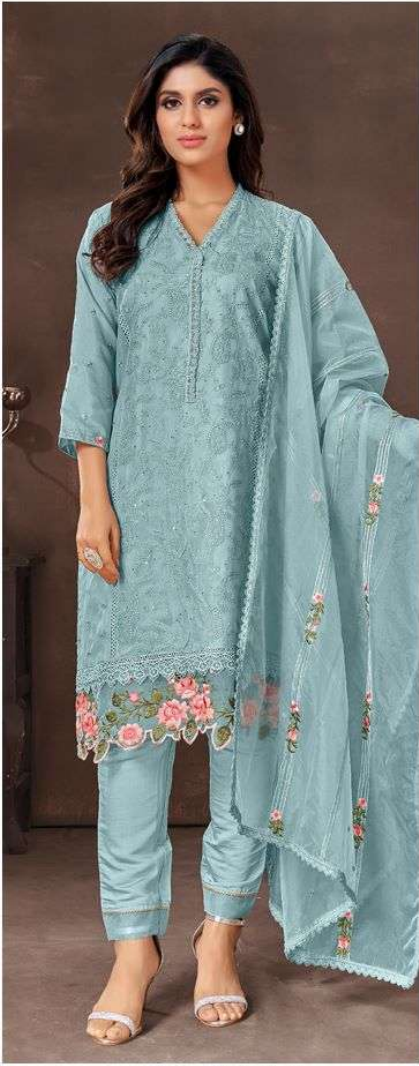
C - 1620 A