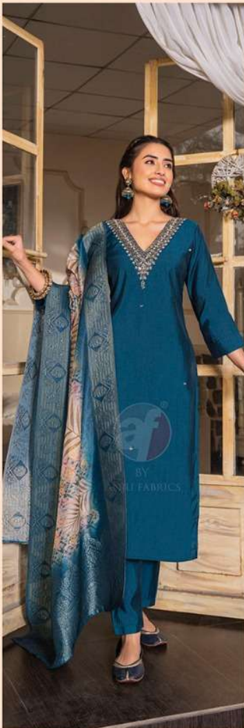
इतिहासकारत VOLUME.5 3461