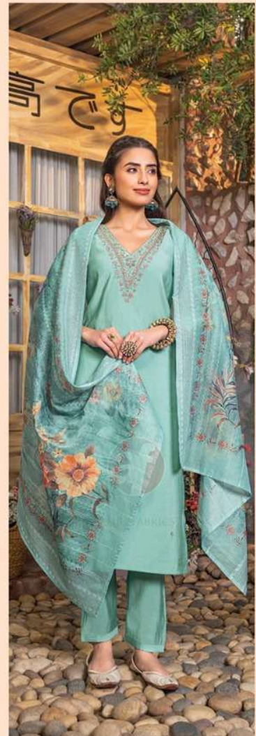
इतिहासकारत VOLUME.5 3463