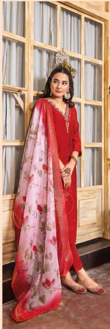
इतिहासकारत VOLUME.5 3462