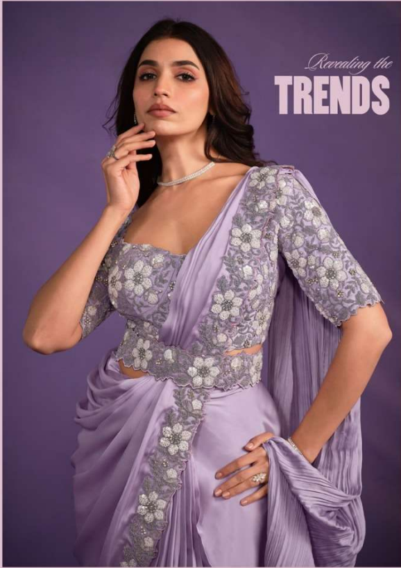
A Fashion Odyssey into the Pulse of Contemporary trends