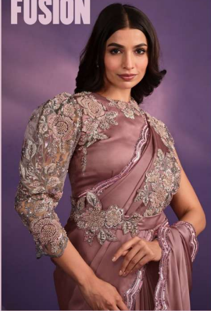
A Femme Fatale's journey through irresistible style dynamics