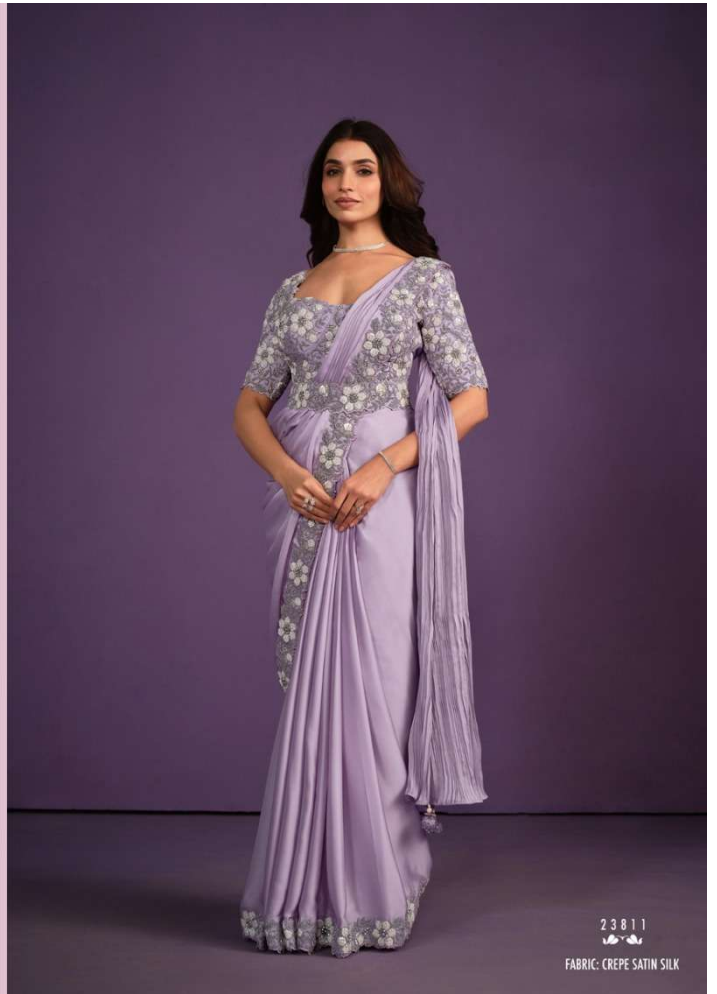
23811 FABRIC: CREPE SATIN SILK