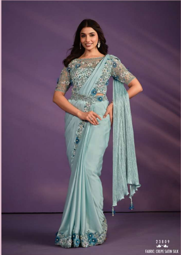
When tradition meets Innovation in every stitch of woven designs