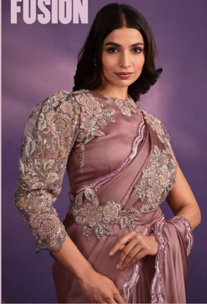
A Femme Fatale's journey through irresistible style dynamics