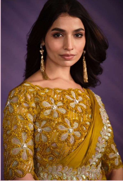
A luxurious affair of opulence, design, and desired splendor