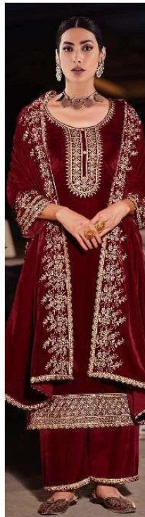
D.NO.160 - A