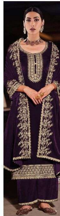
D.NO.160 - C