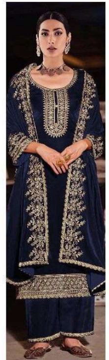
D.NO.160 - D