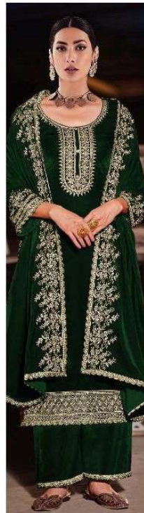
D.NO.160 - B