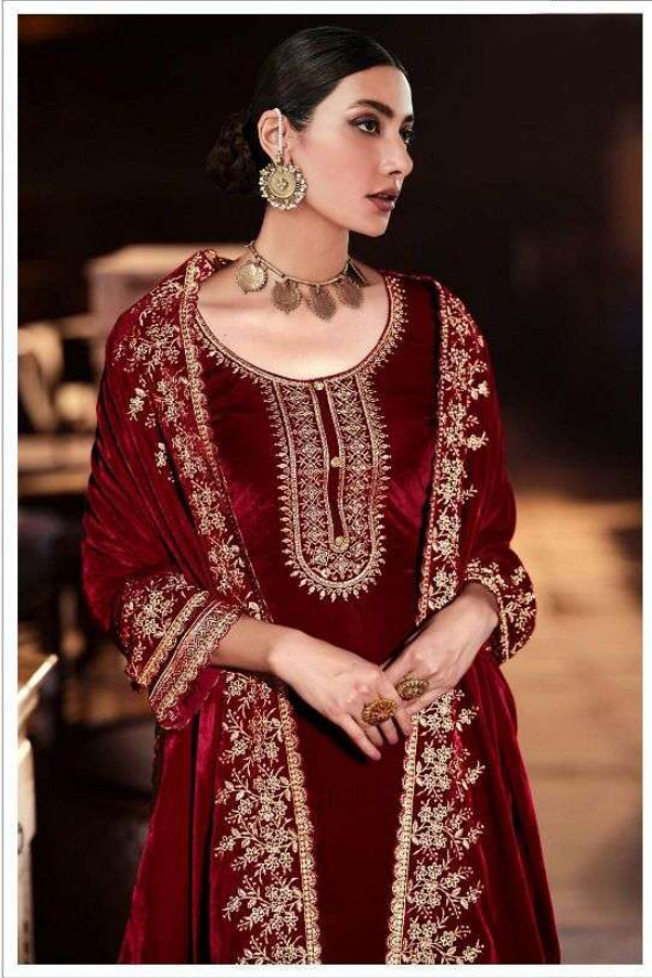
D.NO.160 - A

TOP :- VELVET DUPATTA :- VELVET BOTTOM :- VELVET WORK :- JARI SEQUENCE