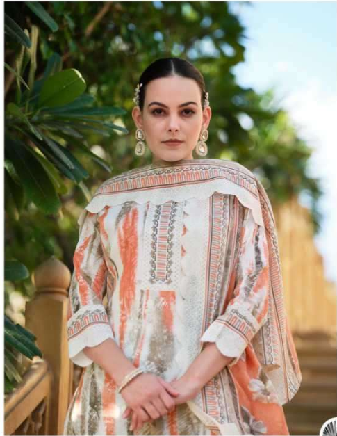
"What you wear is how you present yourself to the world, especially today, when human contacts are so quick. Fashion is natural language."