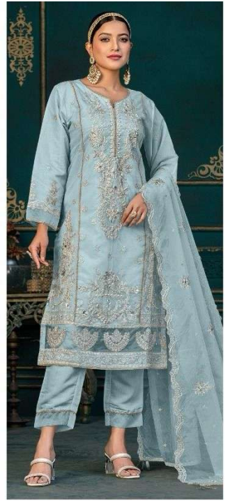
C - 1765 D