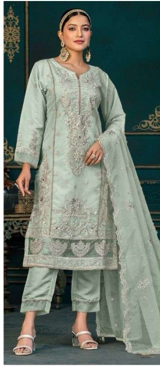
C - 1765 B