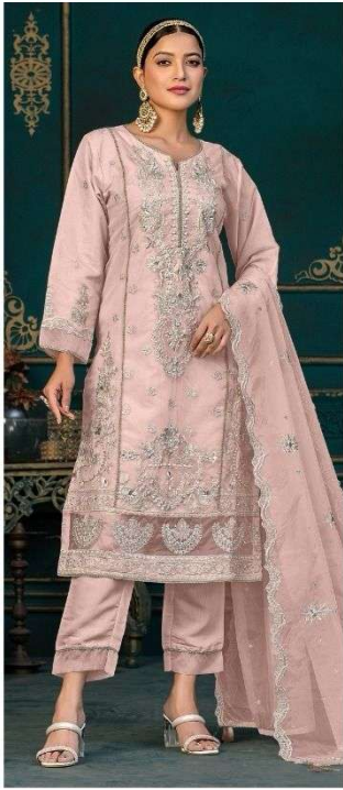
C - 1765