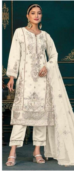
C - 1765 C