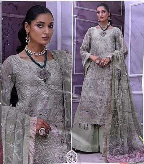
MARYAM'S VOL-2 ZAHA D.No. TOP faux with BOTTOM il santoon DU