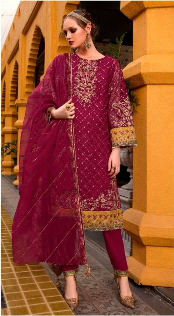
C 1342 A