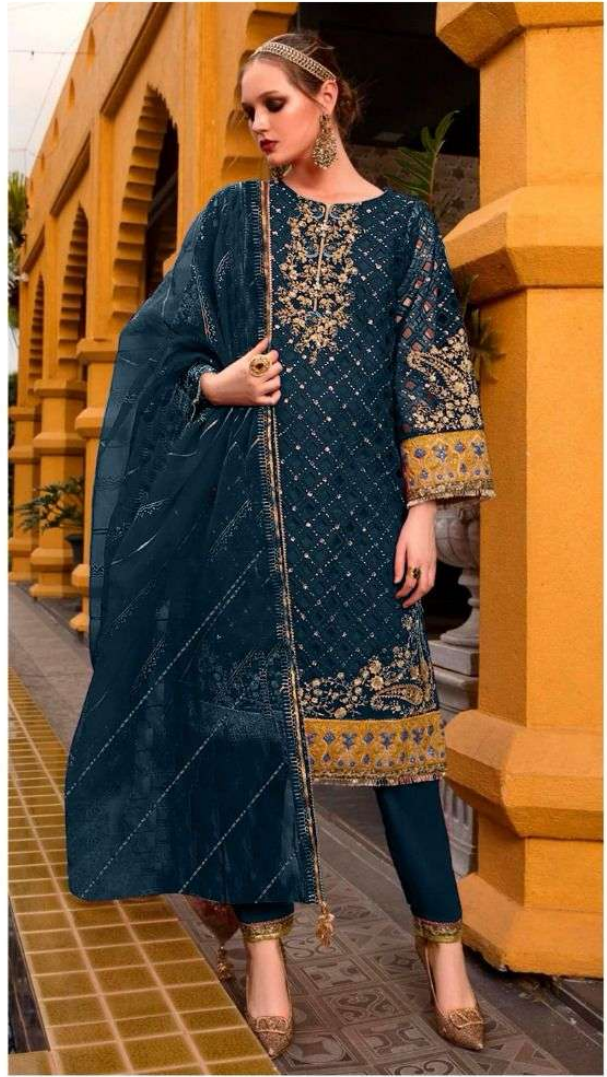
C 1342 B