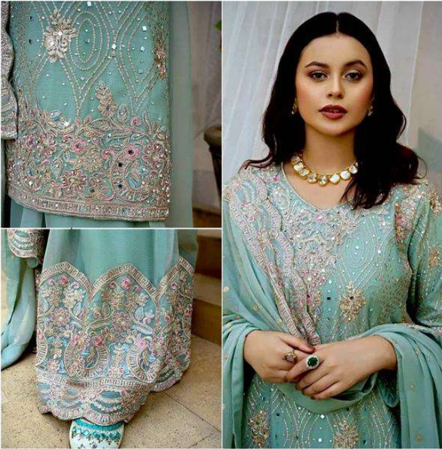
TOP- PURE FOX GEORGETTE WITH HEAVY EMBROIDERY AND SEQUENCE WORK BOTTOM/INNER- DULL SHANTOON WITH HEAVY EMBROIDERY PATCH DUPATTA- PURE FOX GEORGETTE FANCY DUPATTA AND HEAVY EMBROIDERY