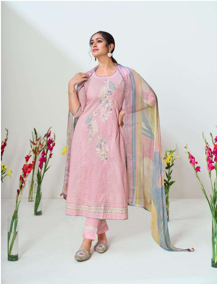
Immerse yourself in unexpected, bright colors & Textures