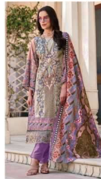
● 534-008 ●