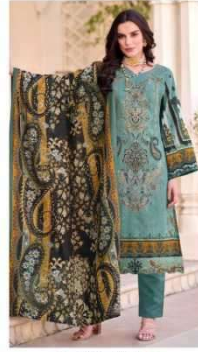
● 534-002 ●