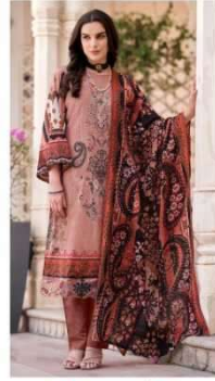
● 534-006 ●