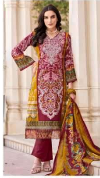
● 534-001 ●