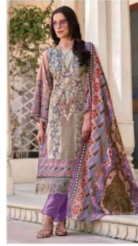
● 534-008 ●