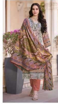
● 534-003 ●