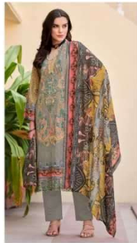
● 534-005 ●