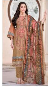
● 534-004 ●