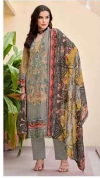
● 534-005 ●