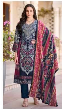
● 534-007 ●