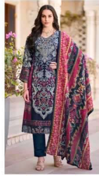
● 534-007 ●