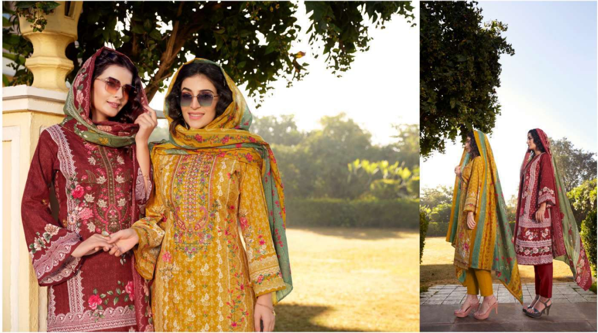
Remains a mystery