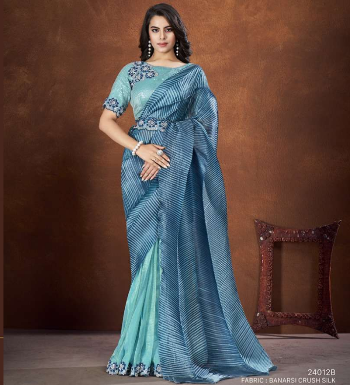
24012B FABRIC : BANARSI CRUSH SILK SEMI READY-TO-WEAR BLOUSE ACCESSORIES WITH: A DESIGNER BELT