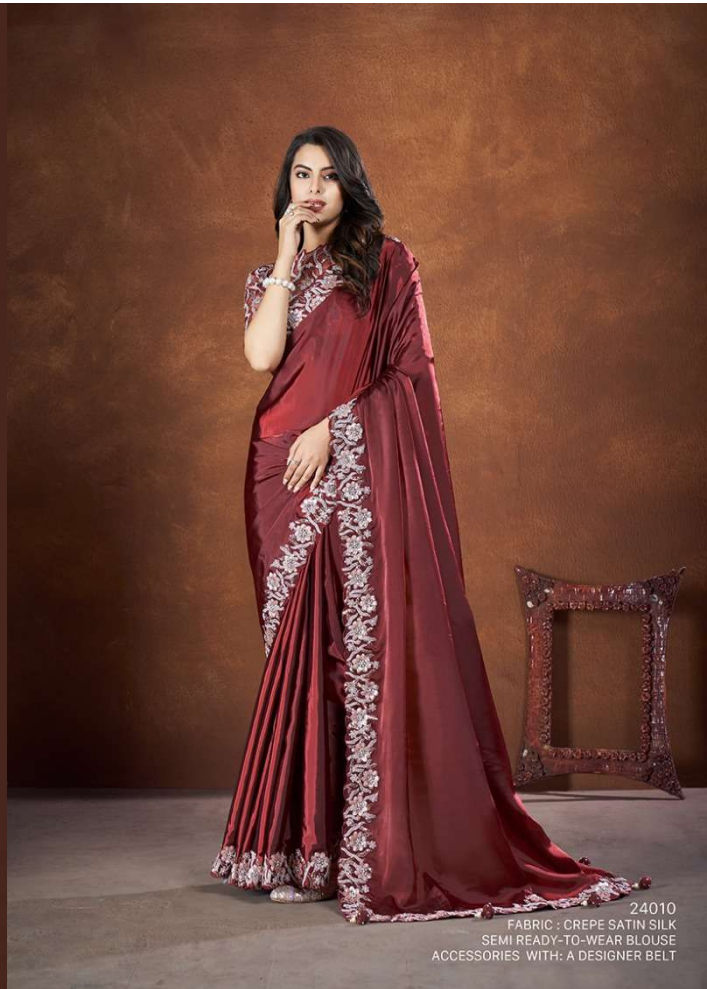
24010 FABRIC : CREPE SATIN SILK SEMI READY-TO-WEAR BLOUSE ACCESSORIES WITH: A DESIGNER BELT