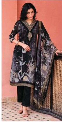
NS - 02