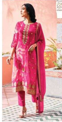
NS - 03