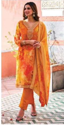
NS - 01