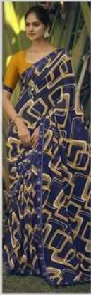
◦ 41138 ◦