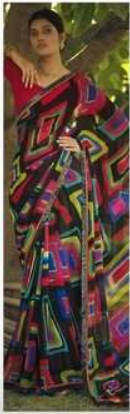
◦ 41129 ◦