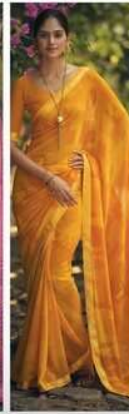
◦ 41134 ◦