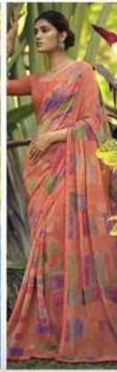
◦ 41132 ◦