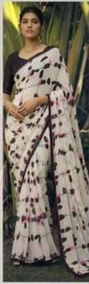
◦ 41140 ◦