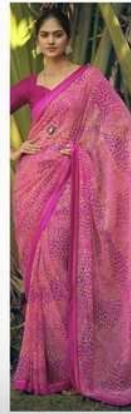
◦ 41133 ◦