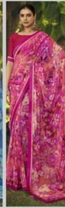
◦ 41145 ◦