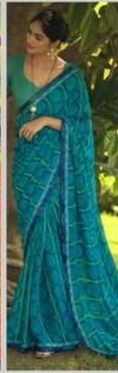
◦ 41142 ◦