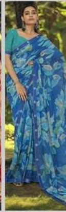
◦ 41144 ◦