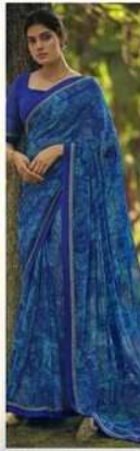
◦ 41131 ◦