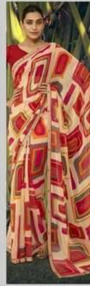
◦ 41143 ◦