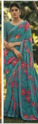
◦ 41135 ◦