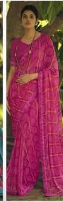
◦ 41136 ◦