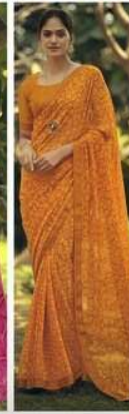
◦ 41137 ◦