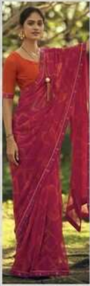
◦ 41139 ◦