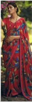
◦ 41128 ◦