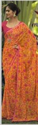
◦ 41141 ◦