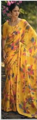
◦ 41130 ◦