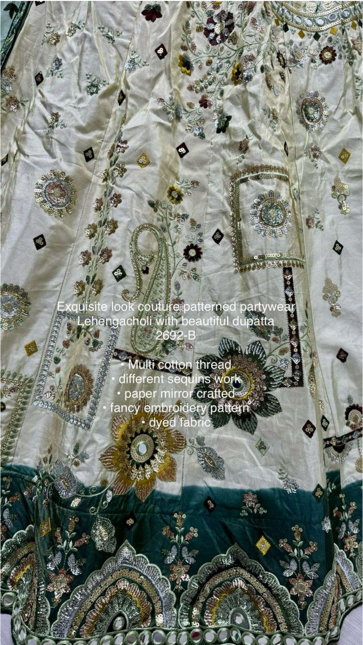
Exquisite look couture patterned partywear Lehengacholi with beautiful dupatta 2692-B