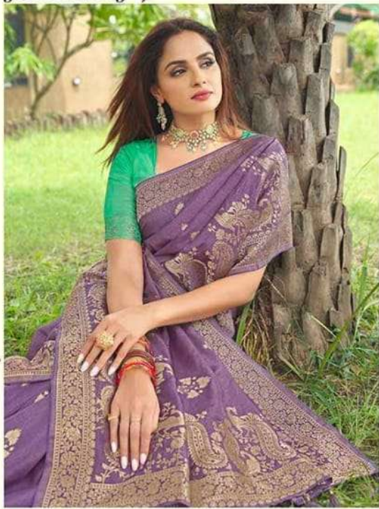
This exquisite work enhance the beauty of womanhood bringing both the goddess of romance.