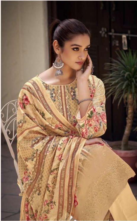
FASHION SPIRIT YOU WILL FIND OUR DESIGNER'S FANCY AND BEAUTIFUL WITH ARTISTIC AND STYLE TO YOUR WARDROBE! A BEAUTIFULLY PRINTED PARTY 218001