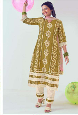
| 9036 |