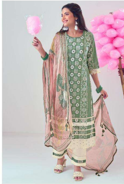
| 9033 |