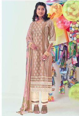
| 9034 |