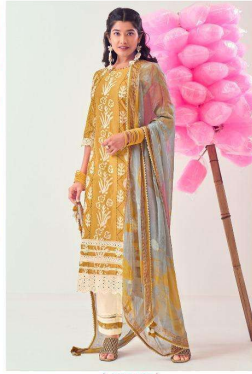
| 9032 |