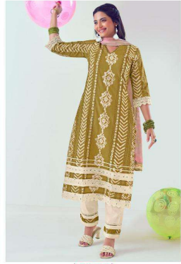
| 9036 |