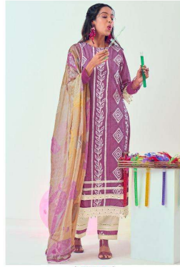
| 9035 |