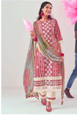
| 9031 |