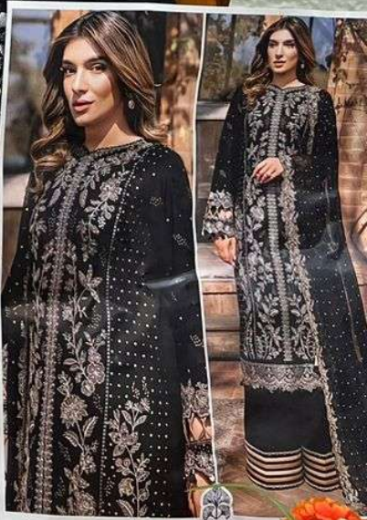
FARASHA VOL-1 ZAHARA TOP Cambic Cotton With Heavy Embroidery