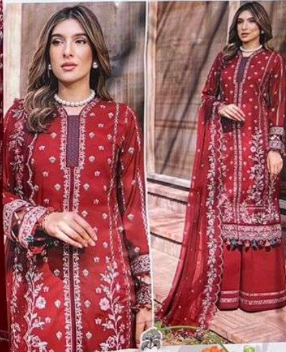
FARASHA VOL-1 TOP Cambric Cotton With Heavy Embroidery Work ZAHN BO 10316