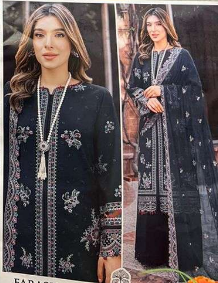
FARASHA VOL-1 ZAHA TOP: Cambric Cotton With Heavy Embroidery Work BOTTOM: IN-SEAM