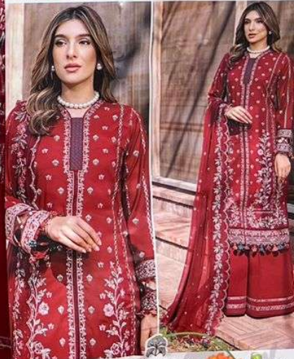
FARASHA VOL-1 TOP Cambric Cotton With Heavy Embroidery Work ZAHN BO 10316