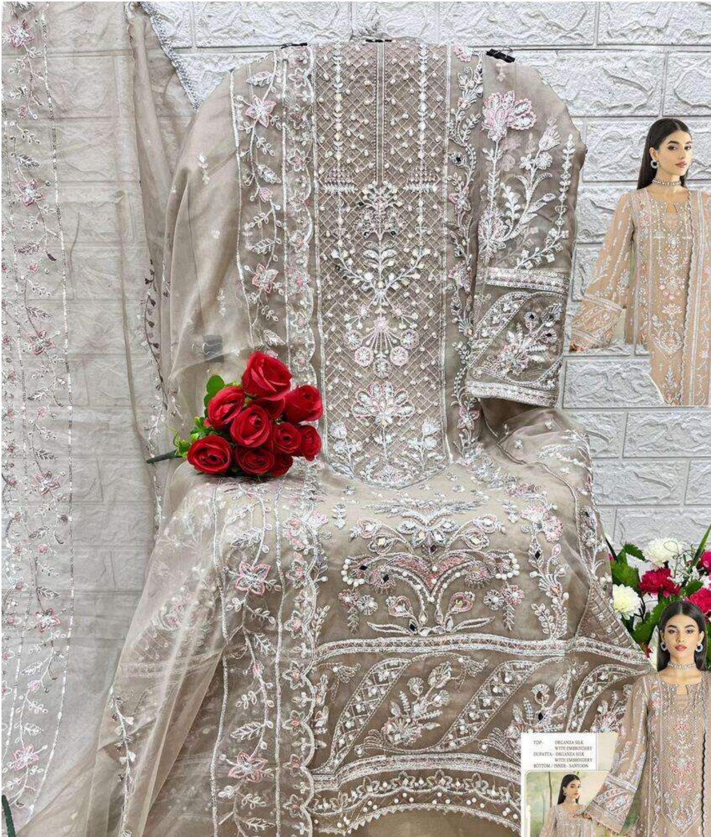
TOP- ORGANDA SILK WITH EMBROIDERY DUPATTA- ORGANDA SILK WITH EMBROIDERY BOTTOM- INNER- SANTOON