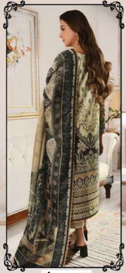
HOUSE OF MIST - 52