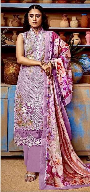
7773 D.No:-463 A

TOP- PURE HEAVY QUALITY JAAM COTTON WITH HEAVY EMBROIDERY AND SEQUENCE WORK BOTTOMINNER- HEAVY QUALITY RAYON COTTON DUPATTA- HEAVY QUALITY MUSLINE COTTON FANCY DUPATTA WITH DIGITAL PRINT