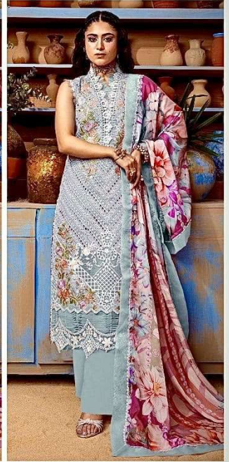
7773 D.No:-463 D