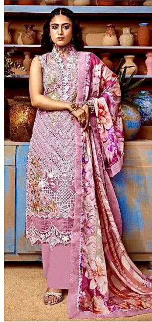
7773 D.No:-463 C