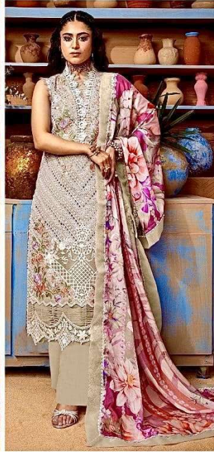
7773 D.No:-463 B