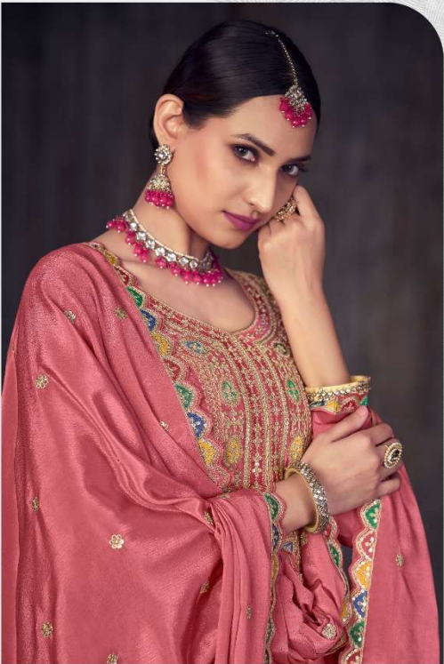
A blend of colors that highlight every corner of the attractive designs that adorn you with vast beauty