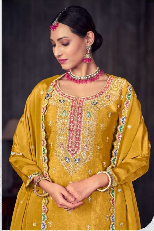
The fusion of subtle ethnic wear that meets the contemporary glam vividly explodes with minute details of elegance