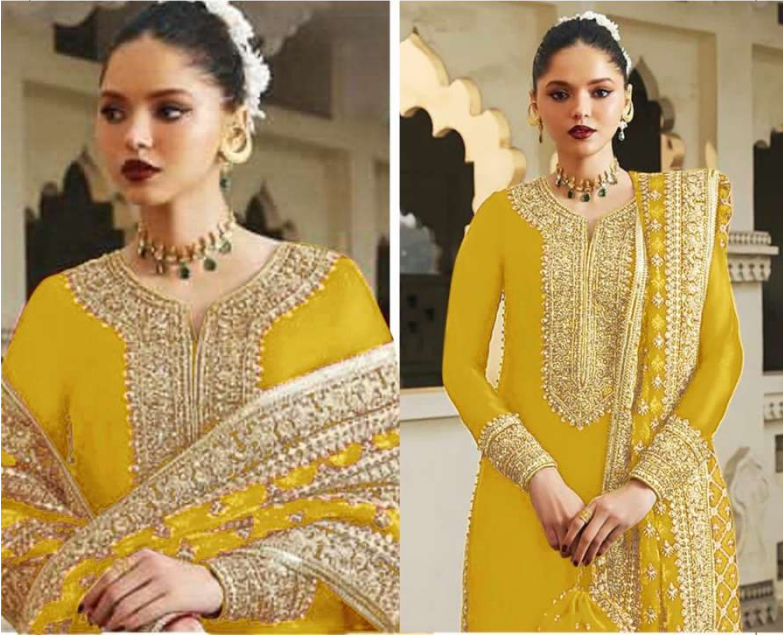
TOP - PURE FOX GEORGETTE WITH HEAVY EMBROIDERY AND SEQUENCE WORK BOTTOM - SANTOON DUPATTA - PURE FOX GEORGETTE FANCY DUPATTA AND EMBROIDERY WORK