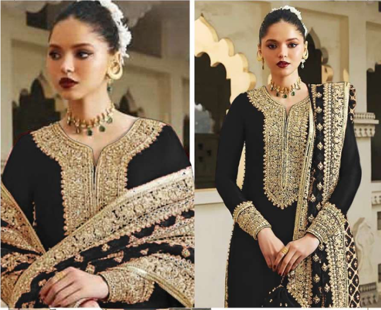
TOP - PURE FOX GEORGETTE WITH HEAVY EMBROIDERY AND SEQUENCE WORK BOTTOM - SANTOON DUPATTA - PURE FOX GEORGETTE FANCY DUPATTA AND EMBROIDERY WORK