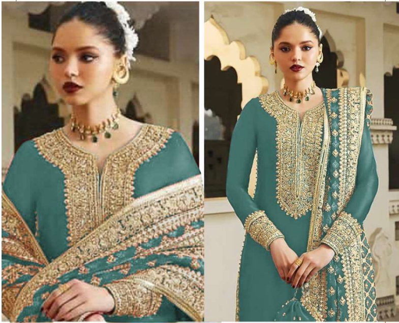
TOP - PURE FOX GEORGETTE WITH HEAVY EMBROIDERY AND SEQUENCE WORK BOTTOM - SANTOON DUPATTA - PURE FOX GEORGETTE FANCY DUPATTA AND EMBROIDERY WORK