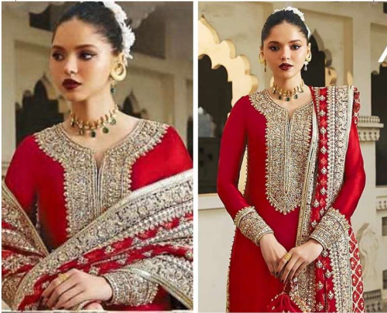
TOP - PURE FOX GEORGETTE WITH HEAVY EMBROIDERY AND SEQUENCE WORK BOTTOM - SANTOON DUPATTA - PURE FOX GEORGETTE FANCY DUPATTA AND EMBROIDERY WORK