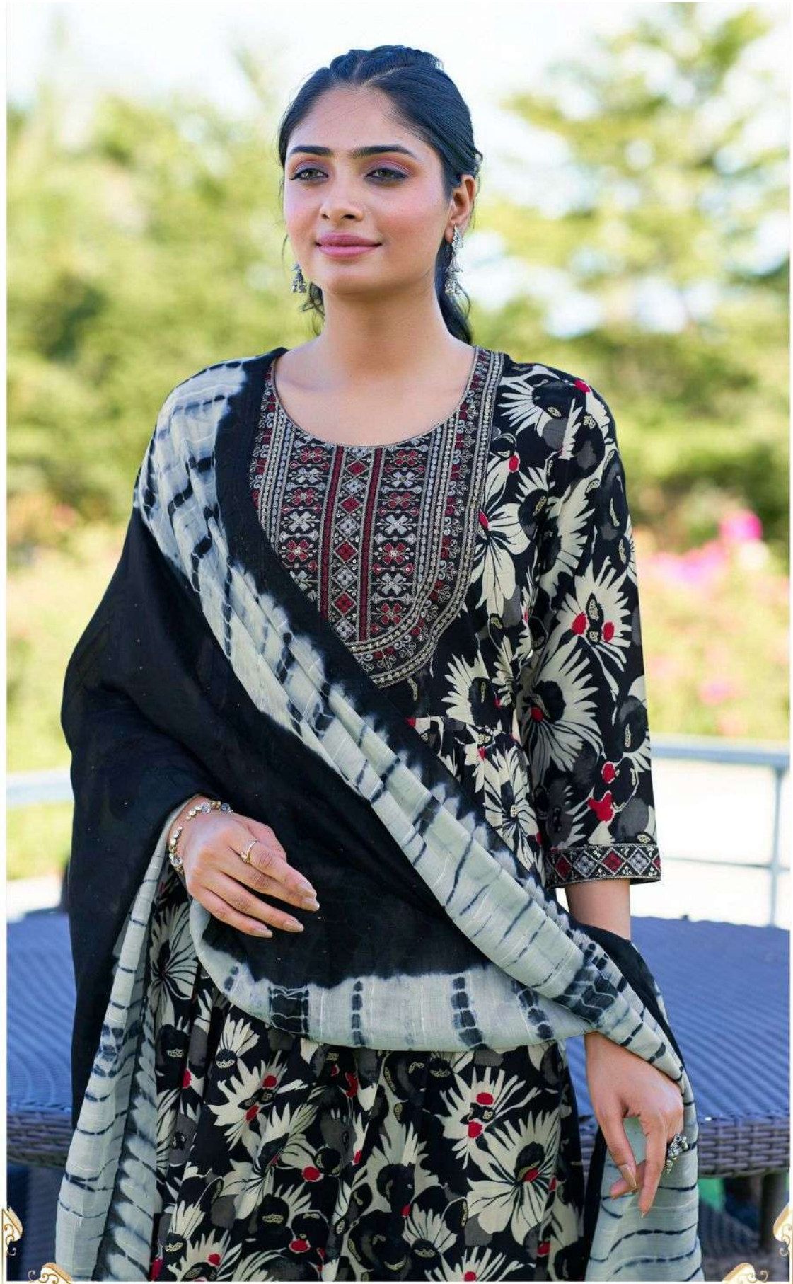
Luxe fabrics, bold patterns & sumptuous detailing adorn modern silhouettes.