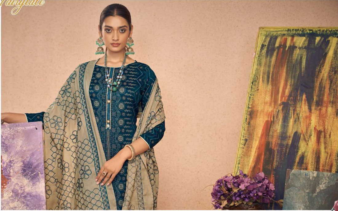
A fairytale of emotions, thoughts and chronicles.