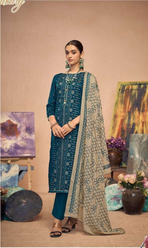
An expression of true luxury inspired by the royals. D.N.94003