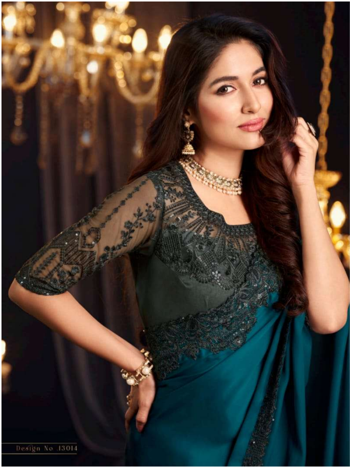
Design No. 13014