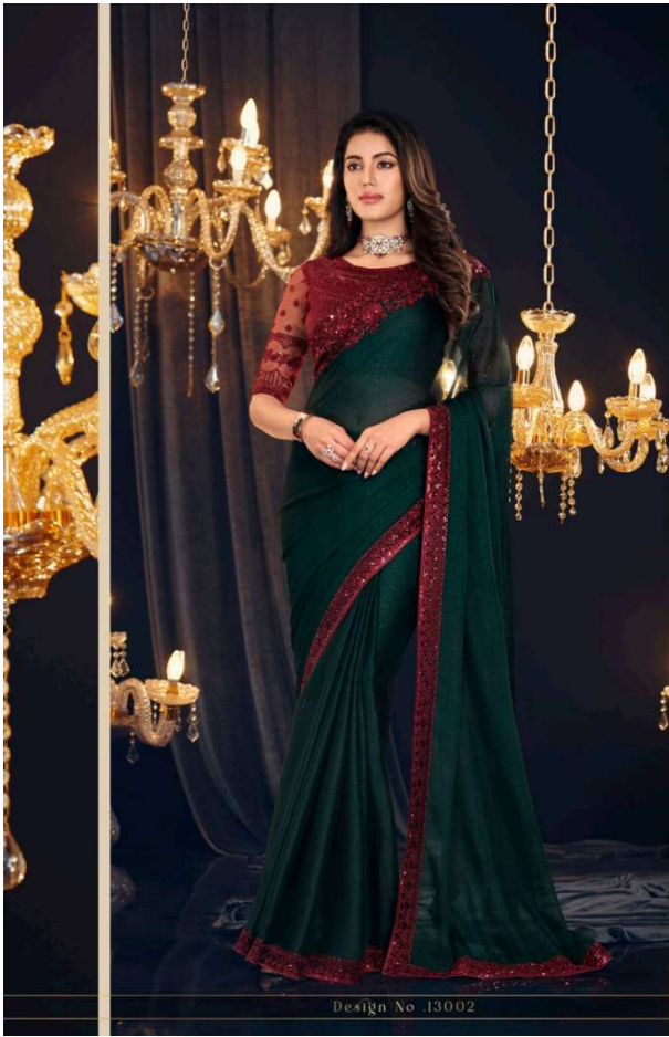
Design No -13002