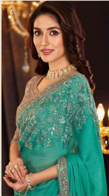
Design No .13005