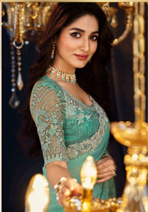
Design No. 13007