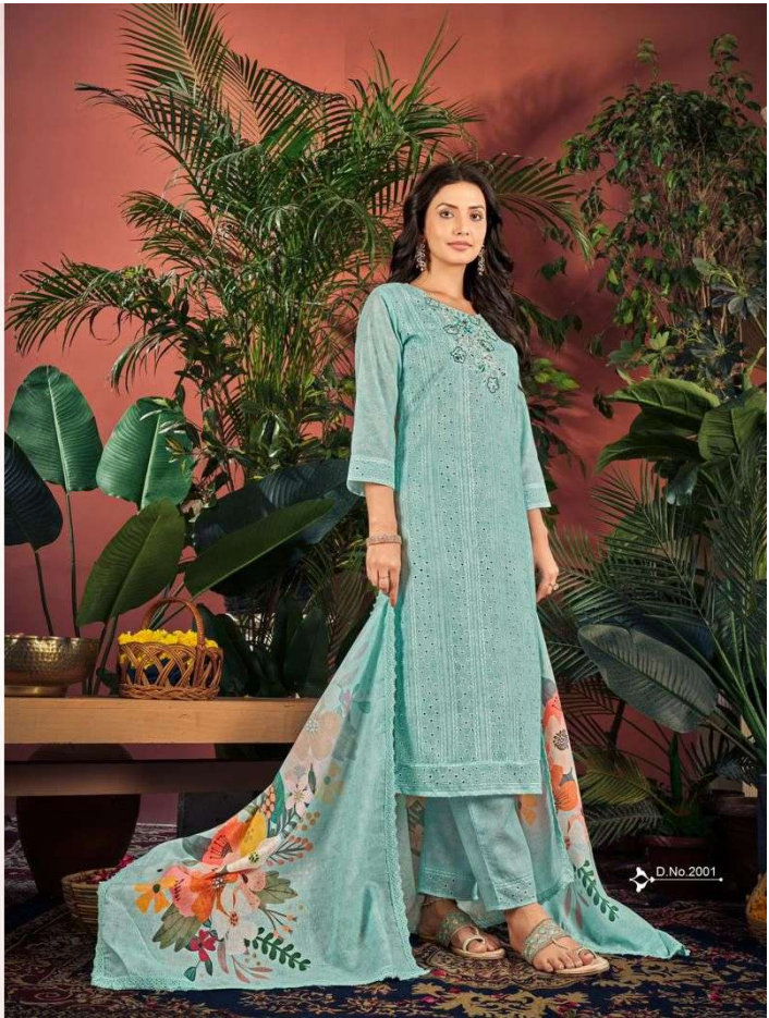
"Elegance Woven in Every Thread, Dresses that Define True Beauty."

A SYMPHONY of fresh tones and FLORAL IMAGERY SPRING SUMMER 20 2 4