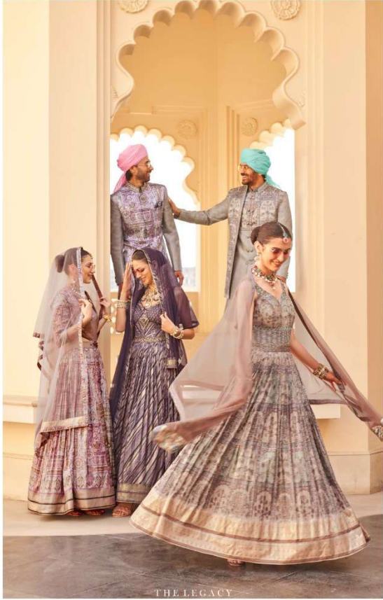
THE LEGACY श्रृंगार