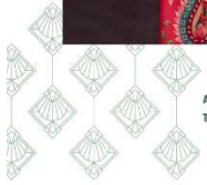
A GLORIOUS TRIBUTE TO A WOMAN 1194