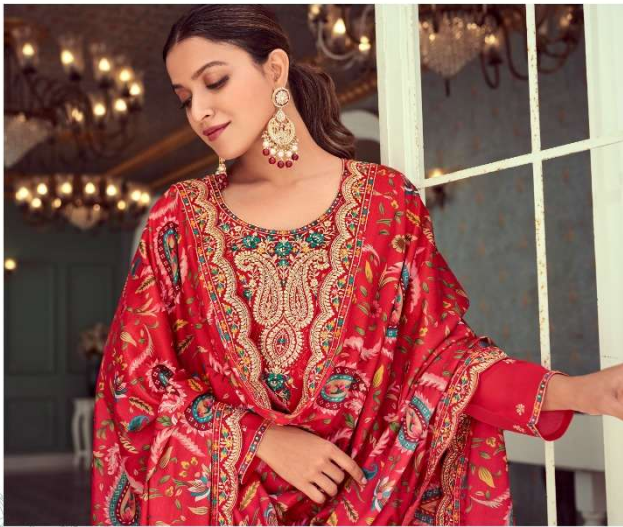
A GLORIOUS TRIBUTE TO A WOMAN 1194