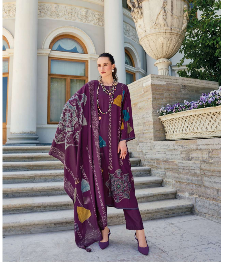
PURE ELEGANCE WITH ALLURING FLORAL PATTERNS ON LACY FABRIC AND ADD GLAMOUR TO YOUR STYLE