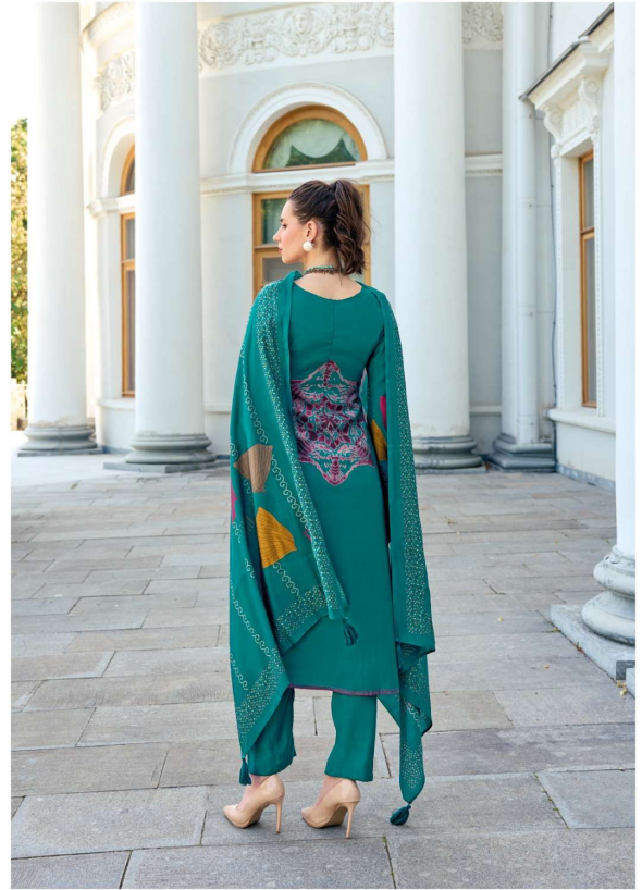
WHEN WE CHOSE TO TAKE INSPIRATION FROM INDIAN BEAUTY , THE RESULT IS HERE A SET OF VIVID COLORFUL DESIGN TOLD A STORY ABOUT FASHION .