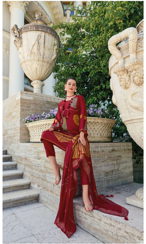
AN INSPIRATIONAL FABRICS UNDER THE DESIGNER PRINTED, IS TRUE TO ITS NAME, TRADITIONAL AND FOR WOMAN FROM ALL WALKS OF LIFE.