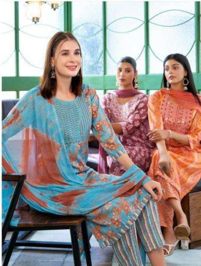
Embroidered Kurti, Designer Kurtis, Printed Kurti, Cotton Kurtas, Lenin Kurtis, Georgette Kurti, Long Kurtis, Short Kurtis, Traditional Kurti, Ethnic Kurtis and Fashion Kurtis are the variants of Indian Kurtis