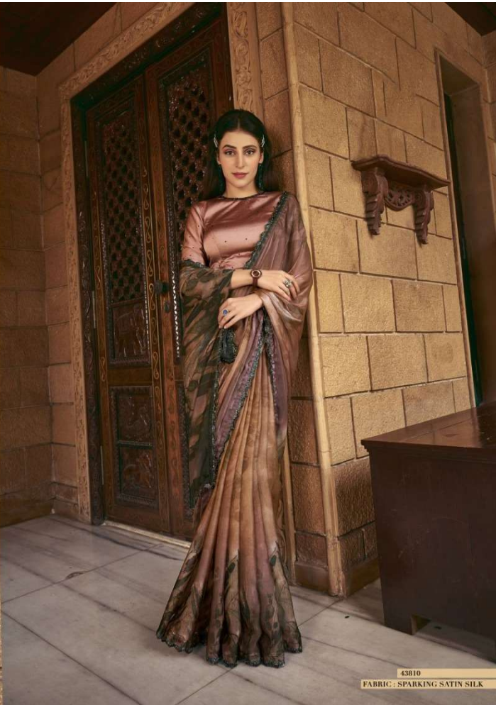
43810 FABRIC : SPARKING SATIN SILK