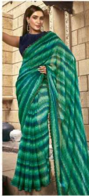
43807 FABRIC : SPARKING SATIN SILK CRUSH BLOUSE