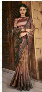
43810 FABRIC : SPARKING SATIN SILK