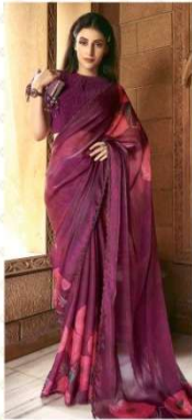
43806 FABRIC : SPARKING SATIN SILK CRUSH BLOUSE