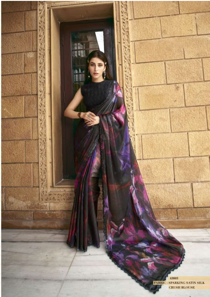
43803 FABRIC: SPARKING SATIN SILK CRUSH BLOUSE