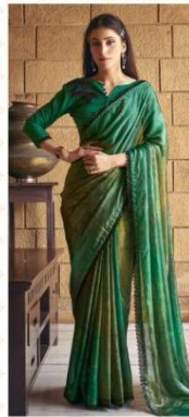
43809 FABRIC : SPARKING SATIN SILK