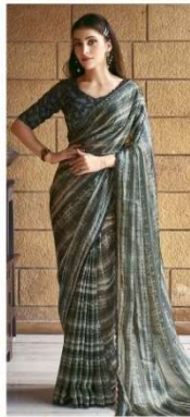
43805 FABRIC : SPARKING SATIN SILK