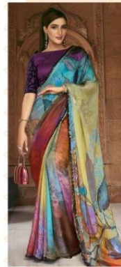
43811 FABRIC : SPARKING SATIN SILK