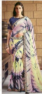
43812 Fabric : Satin Silk Georgette Accessorized with : A Designer Belt