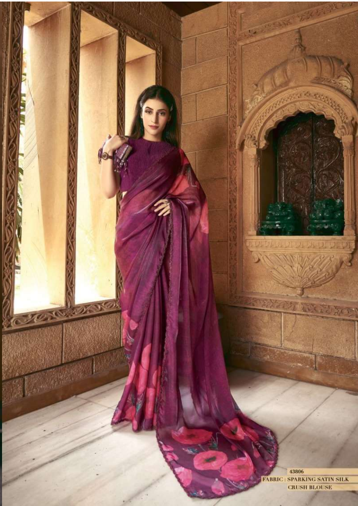
43806 FABRIC: SPARKING SATIN SILK CRUSH BLOUSE