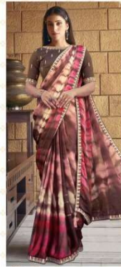
43813 FABRIC : CREPE GEORGETTE