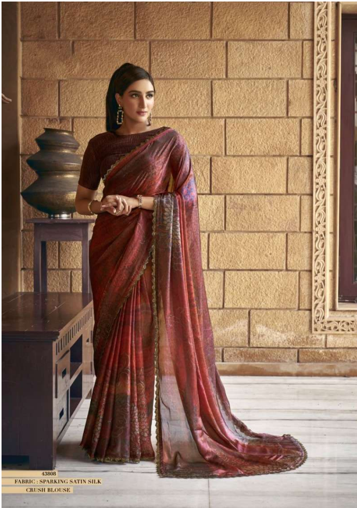
43908 FABRIC: SPARKING SATIN SILK CRUSH BLOUSE