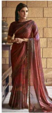
43808 FABRIC : SPARKING SATIN SILK CRUSH BLOUSE