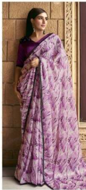
43804 FABRIC : SPARKING SATIN SILK