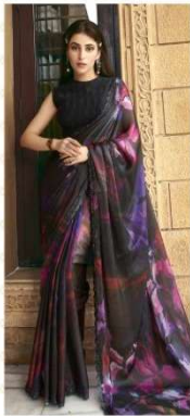
43803 FABRIC : SPARKING SATIN SILK CRUSH BLOUSE