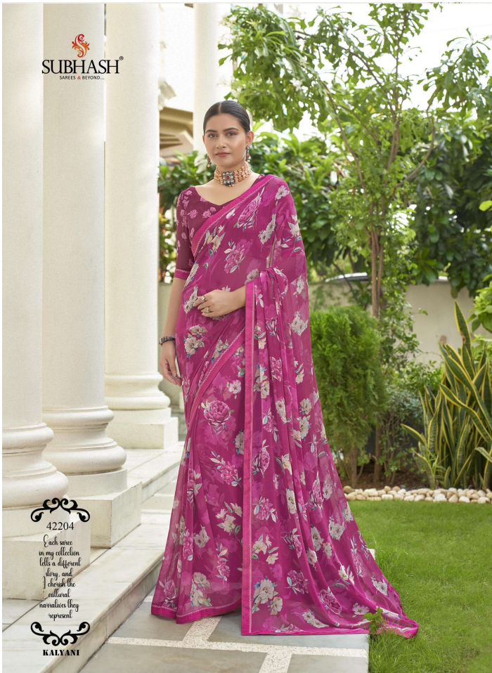
42204 Each saree in my collection tells a different story and I cherish the cultural narratives they represent.