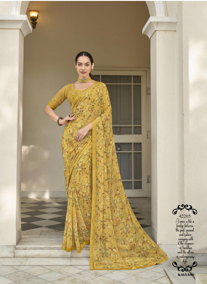
42205 A saree is like a bridge between the past, present, and future, carrying with it the elegance of tradition and the allure of contemporary style.