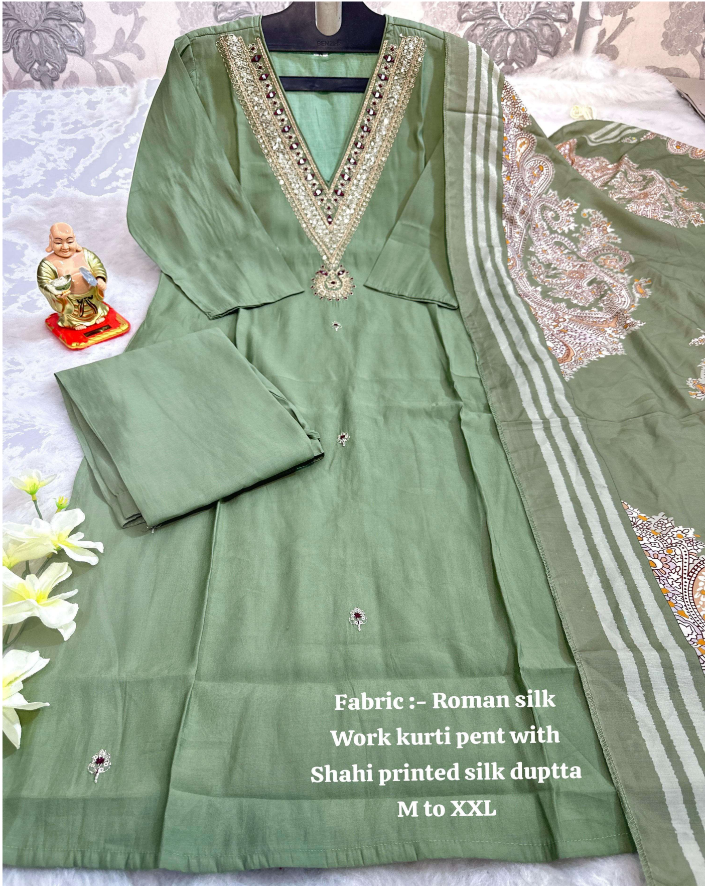
Fabric :- Roman silk Work kurti pent with Shahi printed silk dupatta M to XXL