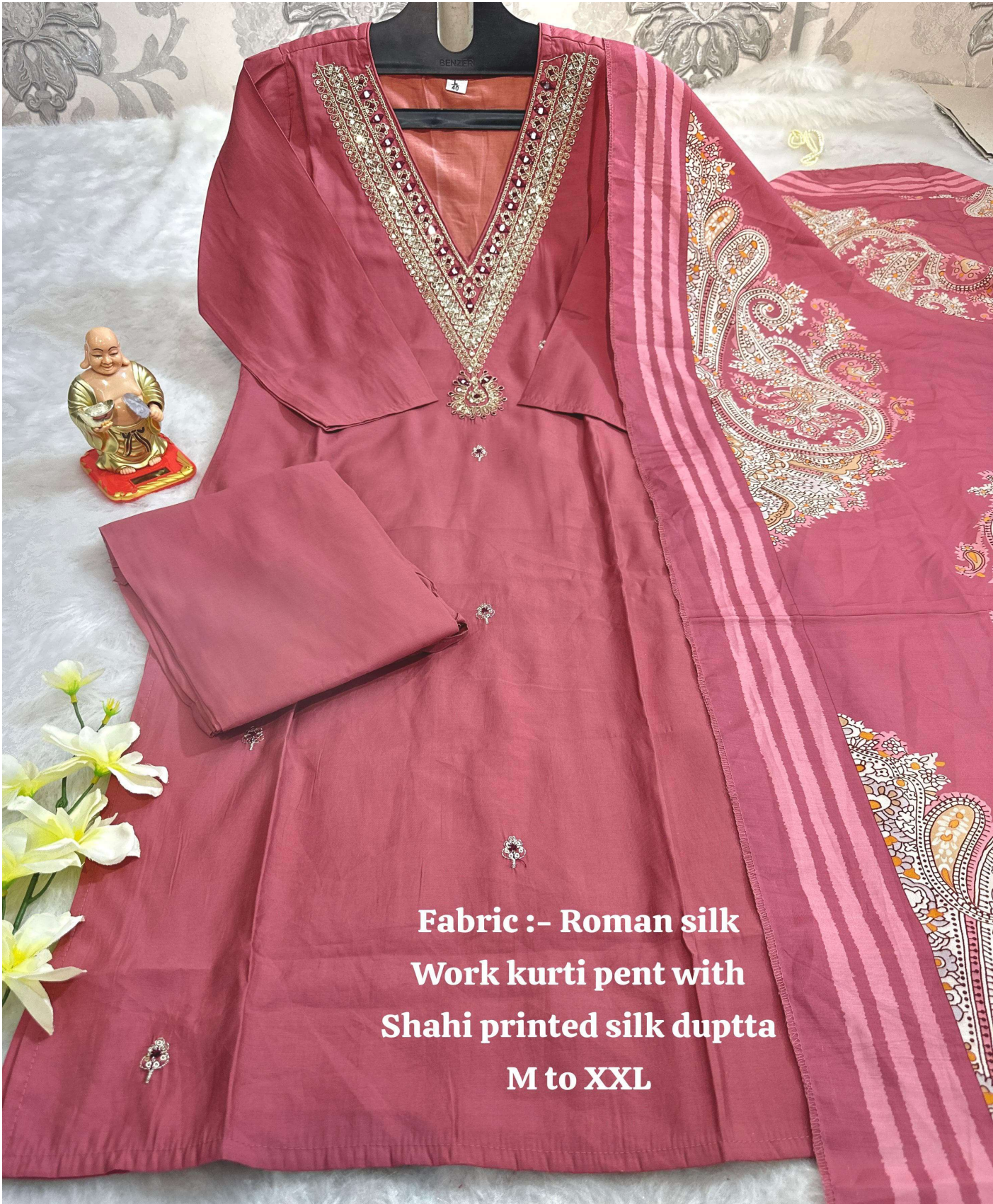
Fabric :- Roman silk Work kurti pent with Shahi printed silk dupatta M to XXL