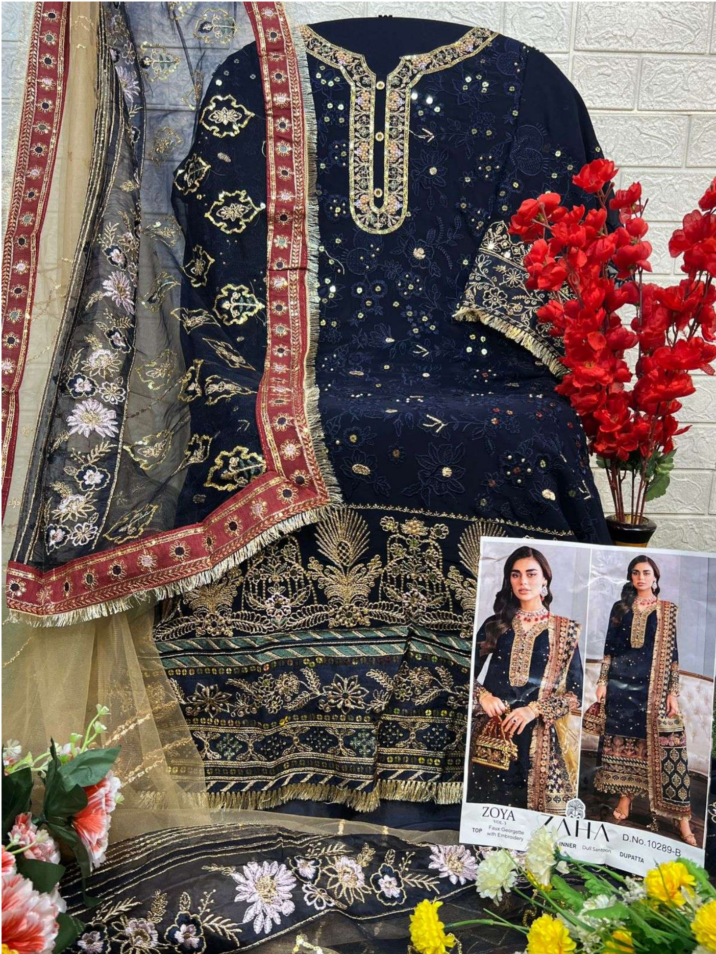
ZOYA VOL.3 TOP Fabric: Georgette with Embroidery ZAHA INNER Dull Satin DUPATTA D.No.10289-B