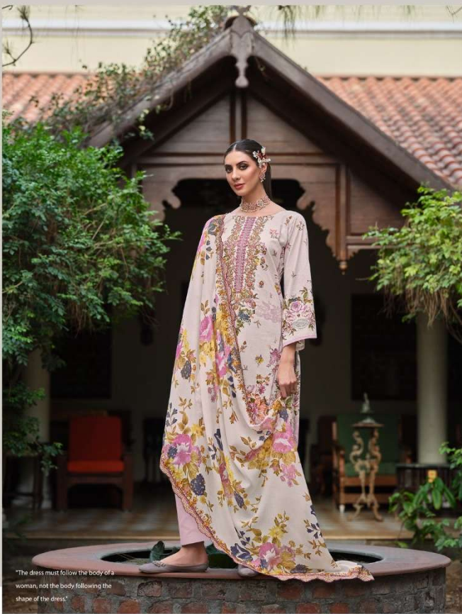
"The dress must follow the body of a woman, not the body following the shape of the dress."