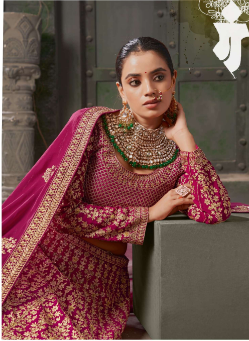
Overdressed and undercharged in this stunning lehenga