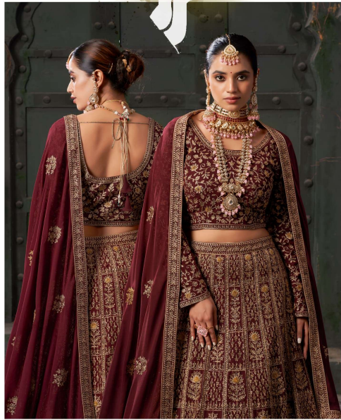
Embroidery is all about threads. Gold and silver threads are highly in demand today, as they are much in vogue nowadays and moreover convey royal feel to outfit. Other color threads like maroon, red, etc are also much in use. However, before choosing the thread for the embroidery check whether the color of the fabric and the threads used is complementing each other or not. The embroidered bridal lehengas are available in diverse colors, from pastels to darker hues, like green, lemon, lilac, pink, sky blue etc to extravagant colors like dark green, blood red, maroon, purple, orange and soon.