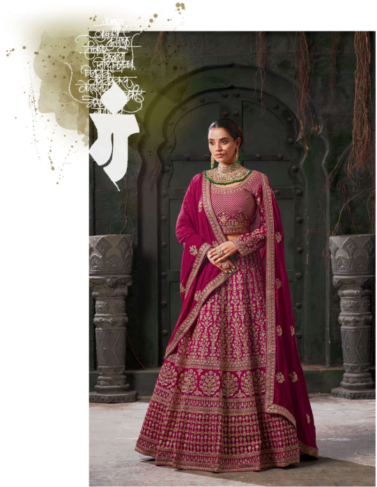
Elegance is an attitude, and my lehenga is the proof