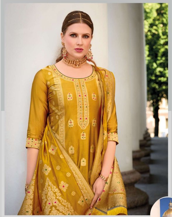
21102 YOU CAN WEAR BLACK AT ANY TIME, YOU CAN WEAR IT AT ANY AGE. YOU MAY WEAR IT FOR ALMOST ANY OCCASION!