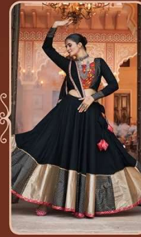
RASS - 2434