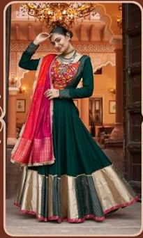
RASS - 2435