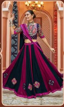
RASS - 2431