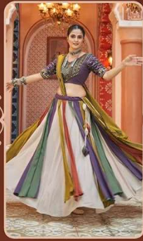
RASS - 2432