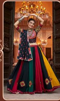
RASS - 2437