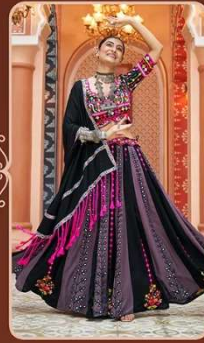
RASS - 2433