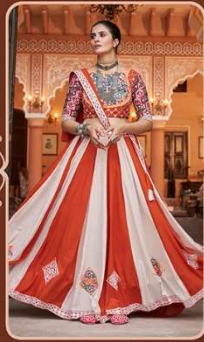
RASS - 2436