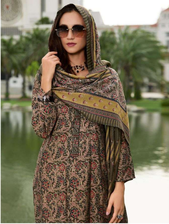
The colours of earth, orange and green, are as soothing as they are luminous. Add a understated radiance to your day with this dress. D.no.15672