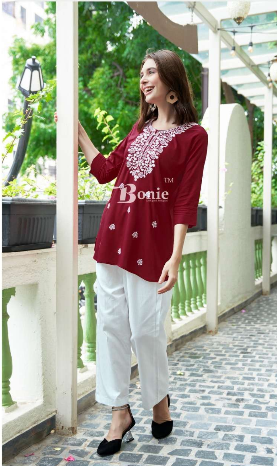
Kurti and Tunic, Indian Fashion Kurti and Tunic are very much in fashion these days. Kurti (Tunic/Top) is just a women's top