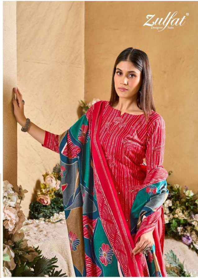
Gleaming metallic, as subtle as rare. Rich textures reflect effortless splendor. To it's beauty I surrender.